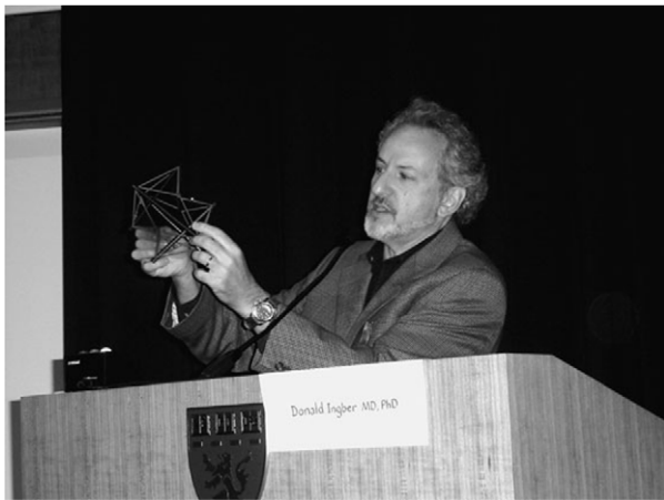
Figure 2 Donald Ingber, MD, PhD, describes the tensegrity model.

Boris Hinz, MER, PhD, addressed the evolution, mechanoregulation, and contractile function of myofibroblasts. Myofibroblasts are atypical fibroblasts that combine the ultra-structural features of both fibroblasts and smooth muscle cells. Due to their expression of stress fiber bundles containing alpha smooth muscle actin, and due to strengthened adhesion sites on their membrane, these cells possess a much higher contractile potential than normal fibroblasts. The contribution of myofibroblast contraction in wound healing is well established; however, more recent discoveries of the presence of myofibroblasts in other connective tissue, such as ligaments, tendons and broad fascial sheets, has provided early evidence that connective tissue contractility is also an important factor in normal musculoskeletal dynamics.