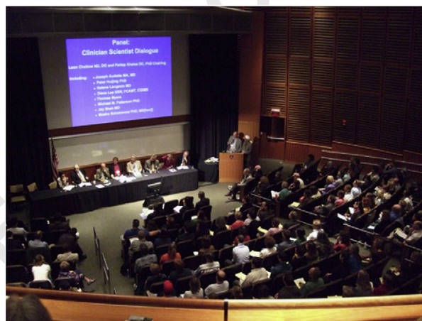
Figure 4 The Clinician–Educator/Scientist panel.

speakers, are directly translatable to the techniques used to restore fascial function as part of structural integration on the macro level. There is clearly much to be gained from further interdisciplinary discussion.”